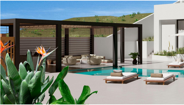
Level 0 / Garden Floor