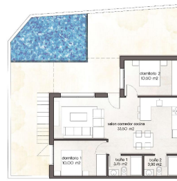
PB / GROUND FL.