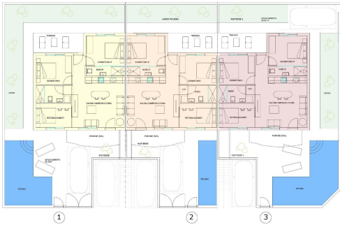
GROUND FLOOR - PLANTA BAJA