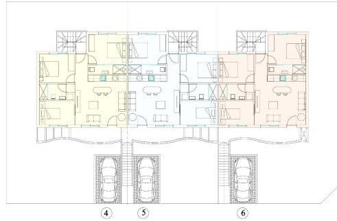
PENTHOUSE - PLANTA ALTA